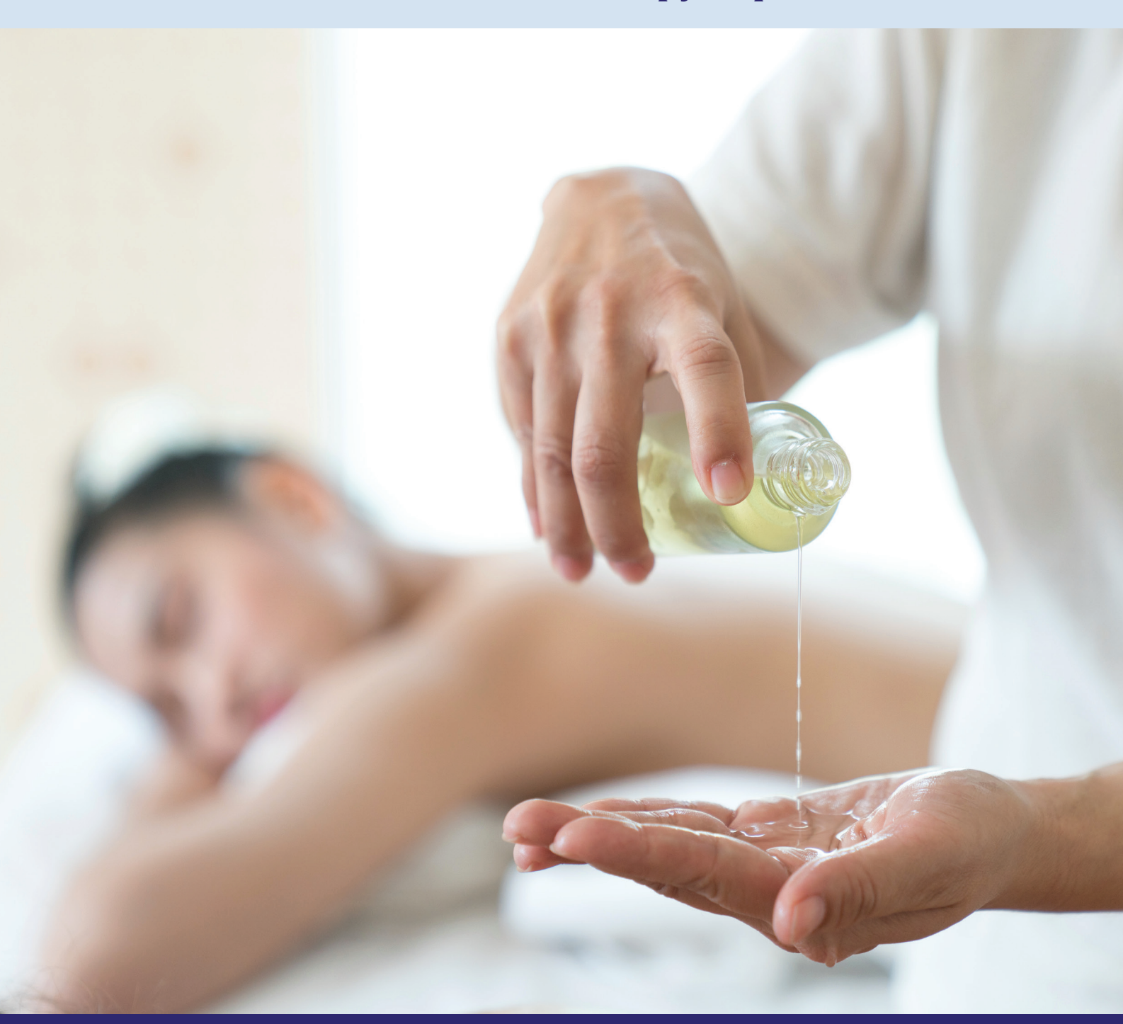
The Professional Body for Aromatherapists

The Professional Aromatherapy Diploma Course